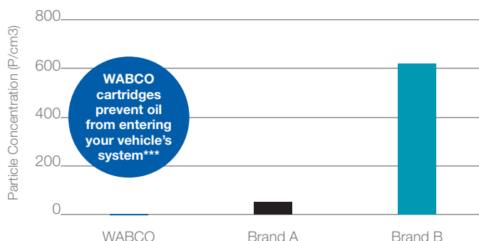
Oil Separation Efficiency: Coalescing Cartridge

Unlike the competitors below, WABCO coalescing cartridges prevent any oil contaminants from passing through to downstream systems.***